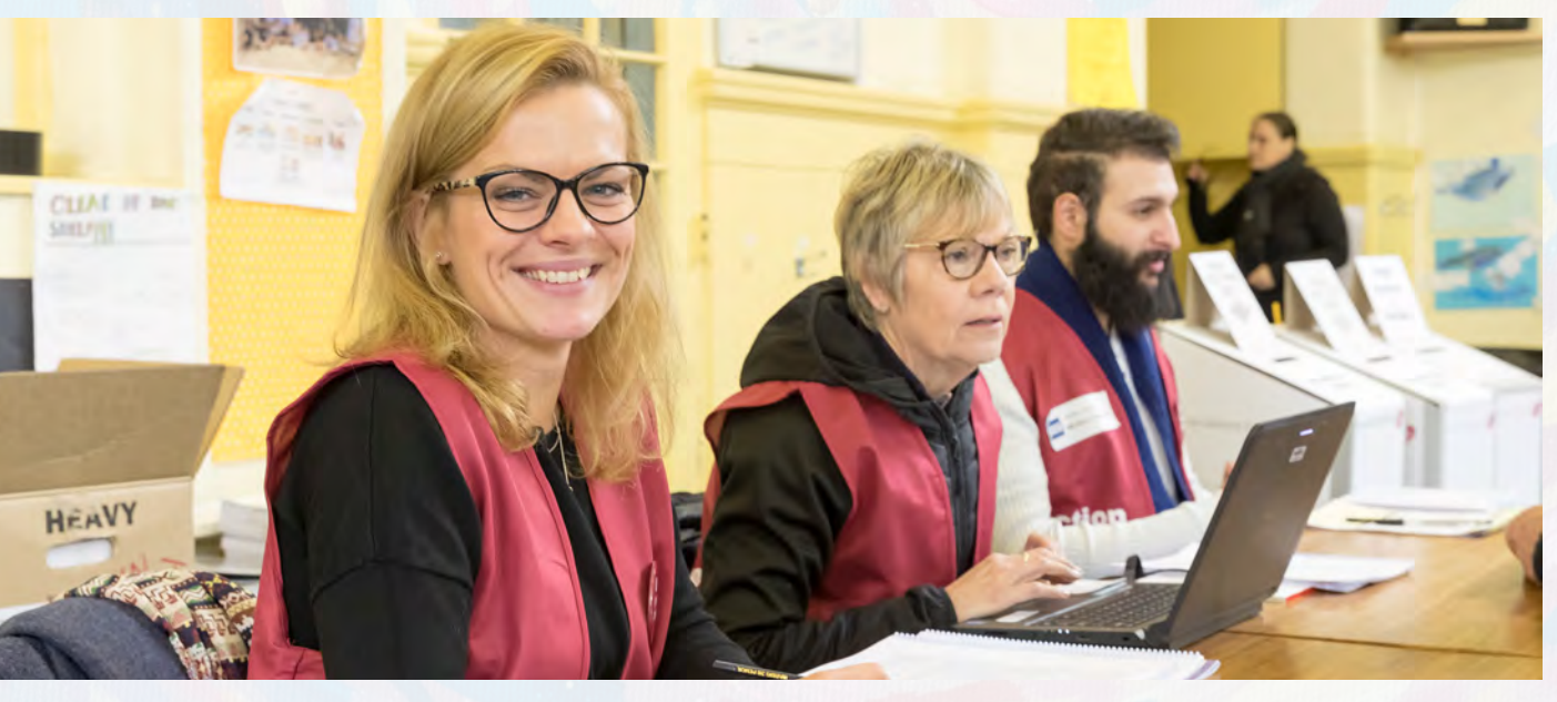
Smiling VEC staff busy at work at the last State election 2018.

However, the VEC is not subject to the direction or control of the Minister in respect to the performance of its responsibilities and functions and the exercise of its power.