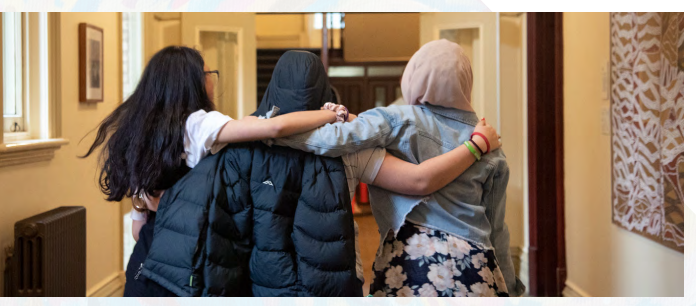
Secondary students at VicSRC Congress 2019 making friends.

The VEC pays respect to ancestors and Elders, past, present and emerging. The VEC is committed to honouring Aboriginal and Torres Strait Islander peoples' unique cultural and spiritual relationships to the land, waters and seas and their rich contribution to society.