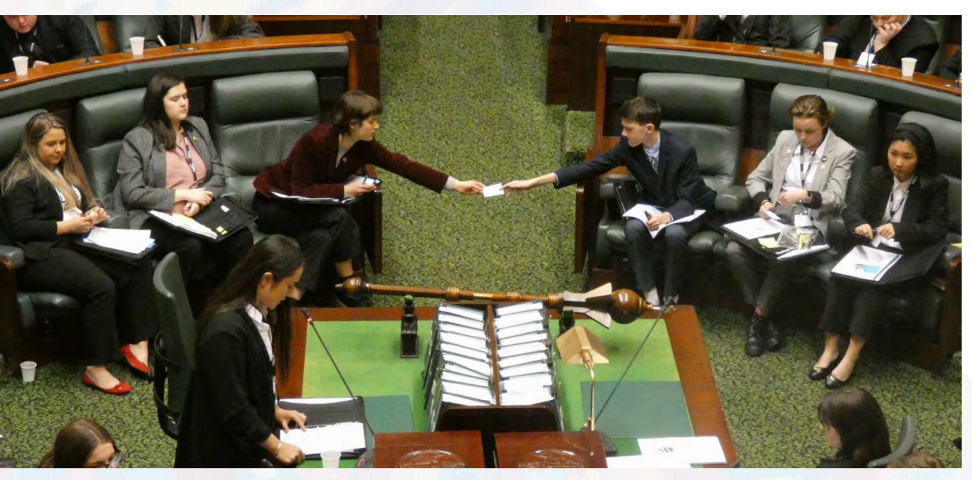
Note passing in the Legislative Assembly during Youth Parliament.

An annual progress summary will be reported in the VEC Annual Report.