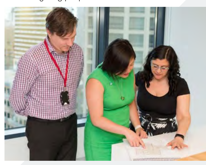
VEC geospatial staff looking over a boundary map.

educate VEC staff on supporting workforce diversity and inclusion to ensure young people are a focus.