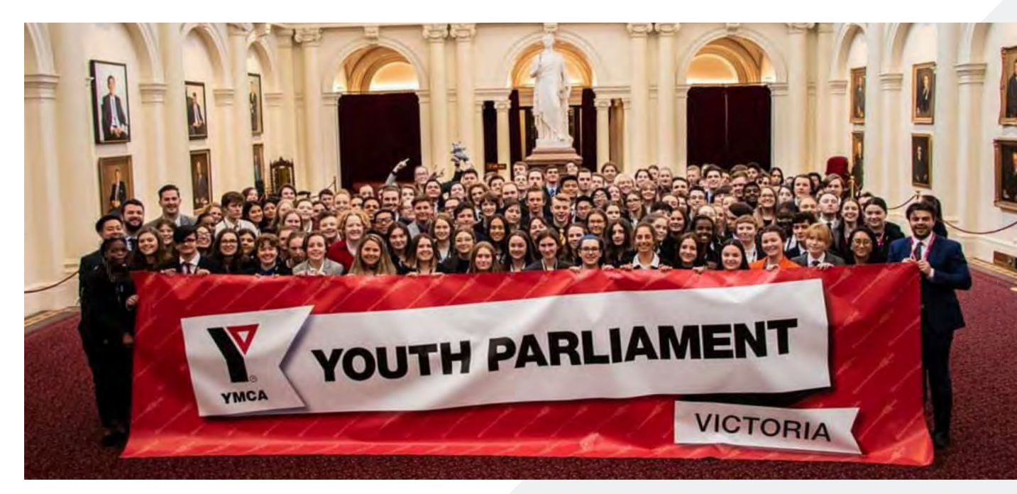
2019 Youth Parliamentarians in Queen's Hall, Parliament of Victoria.