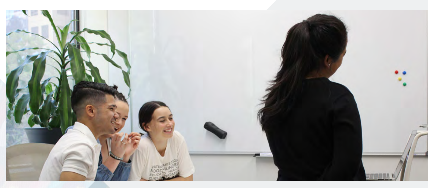
VicSRC Executive Committee students filming a Teach the Teacher webinar.

consultation on the YPIP has ensured it aligns with Strategy 2023, most particularly in the 'relationships' pillar. The VEC's aim is to learn from others outside the organisation about opportunities and challenges. By seeking advice and knowledge from all networks when planning to improve its services and products, the VEC can remain relevant. It can provide services and products that not only meet customer expectations but where possible, have been co-designed with those very same customers.