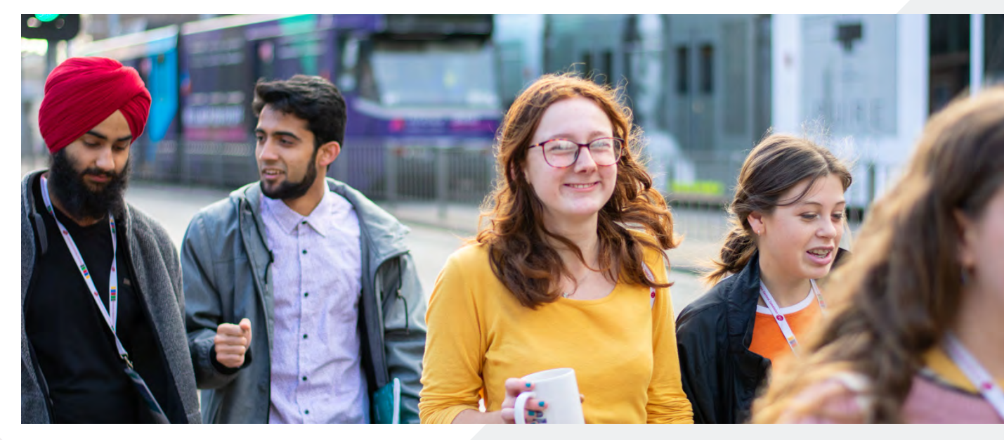
Students at VicSRC Congress 2019 walking to Open Morning to present their solutions to education issues.

The YPIP has been designed following a review of research into young people's electoral engagement and relevant State and Federal government policy impacting young people, namely DHHS's Youth Policy: Building Stronger Youth Engagement in Victoria<sup>3</sup>, and the Australian Government's National Youth Policy Framework (currently under development). Importantly, the Victorian Government is consulting on a Victorian Youth Strategy, due for release in late 2021. Consultations with VEC staff and partner organisations from the youth sector, including the VicSRC, YMCA Victoria and the Department of Premier and Cabinet's Victorian Youth Congress, have also informed the development of the YPIP.