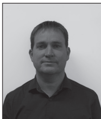
✗ Unsuitable Too dark: photo is overexposed