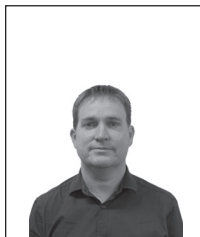
✗ Unsuitable Too small: photo will pixelate when enlarged