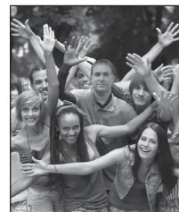
✗ Unsuitable Group photograph: background is distracting