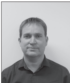
✓ Acceptable Photograph

The photograph quality should be minimum 378 x 449 pixels. See notes for checking the pixel range of your photograph at the bottom of the page. If you do not have a digital copy of the photograph and are planning to provide a hardcopy, you will not need to check the pixel range as digital and SLR cameras default to a higher pixel range than most mobile phone cameras.