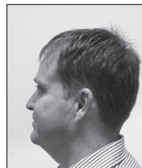
✗ Unsuitable Side profile: full face should be visible