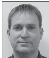
✗ Unsuitable Too large: shoulders should be visible