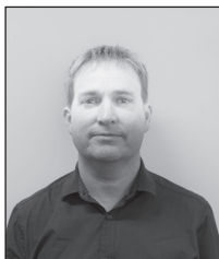
✗ Unsuitable Too light: photo is under- exposed