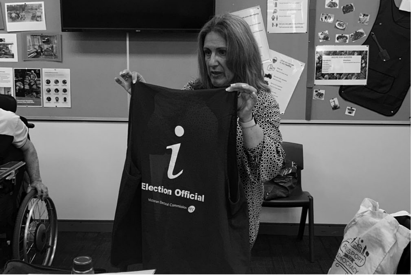
Figure 1: Democracy Ambassador provides a Voter Education Session to a self-advocacy community group.