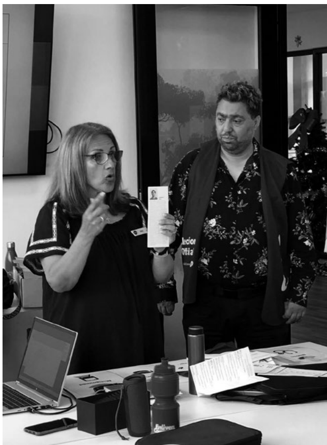
Figure 2: Democracy Ambassador provides Voter Education session to a community group.