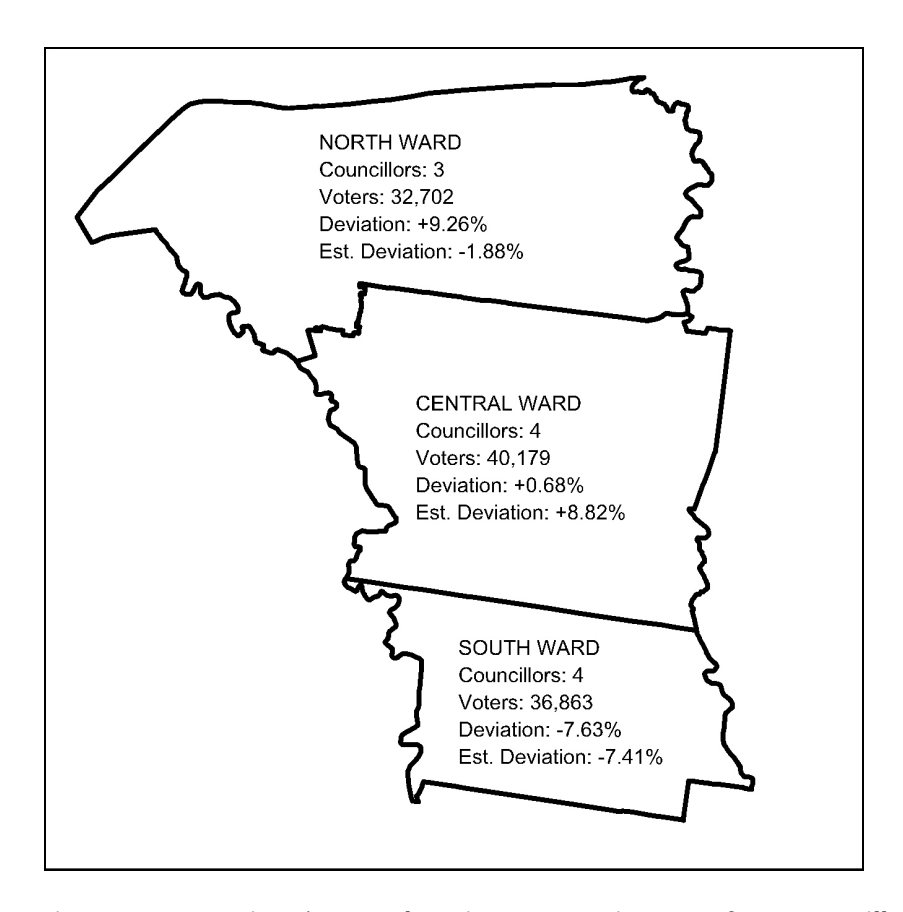
Figure 1: Cr Tapinos' second option, proposing two four-councillor wards and one three-councillor ward in the City of Moreland, using the current voter estimate and deviations and estimated deviations projected to 2021.

Central Wards, voter number deviations could be well contained until the next scheduled electoral representation review. The VEC, however, was concerned that this model compromises representation for the suburbs of Fawkner, Hadfield, Glenroy, Gowanbrae, Tullamarine and Oak Park. The VEC considers that the high levels of cultural and linguistic diversity in the north of the City is a special characteristic that demands higher requirements of local government. Therefore, the VEC considers that having only three councillors in Cr Tapinos' proposed North Ward might detrimentally affect representation for the communities within the area.